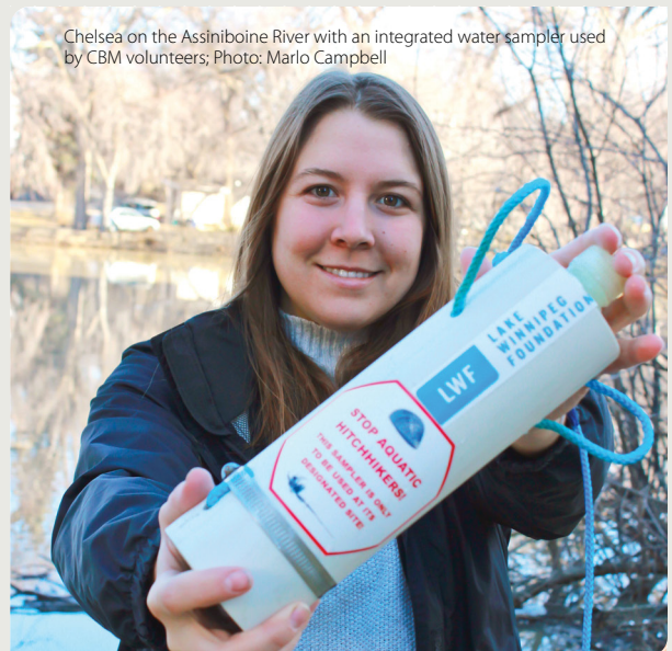
Chelsea on the Assiniboine River with an integrated water sampler used by CBM volunteers

Water monitoring activities are already well underway for 2017. As we collect more data, we will continue to ensure that it is available to both Manitobans and lake-lovers across the country.